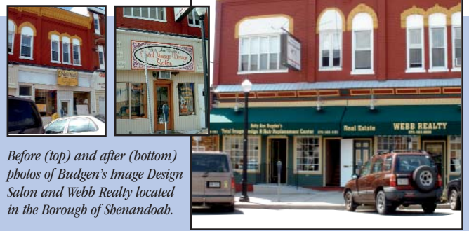
Before (top) and after (bottom) photos of Budgen's Image Design Salon and Webb Realty located in the Borough of Shenandoah.

Please fold this page so that the address below is shown and mail.