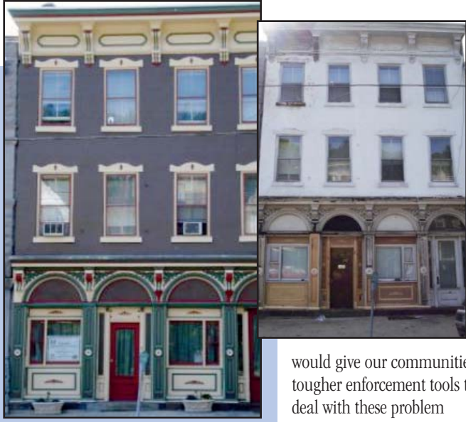
Before and after of the Asbland Historical Society in Asbland Borough.

would give our communities tougher enforcement tools to deal with these problem properties. Landlords and property owners need to be held personally accountable